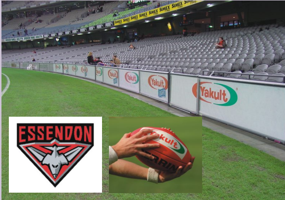
Yakult signage at Essendon home games

Yakult is the proud sponsor of the Essendon Football Club (The BOMBERS) in 2005/2006. This follows Essendon's 2004 end-of-season football trip to Japan and their subsequent visit to Yakult Head Office in Tokyo.